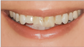
REPOSE (Pre-Op Lip Line)