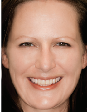
FULL FACE (Temps Lip Line)