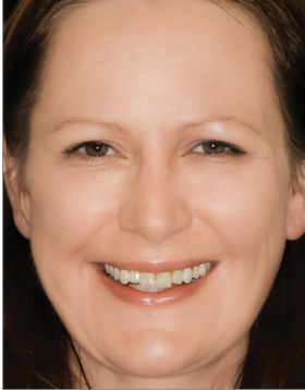
FULL FACE (Pre-Op Lip Line)