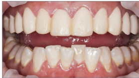
Temps Retracted View-Open