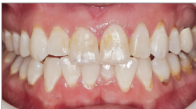
Pre-Op Retracted View-Closed