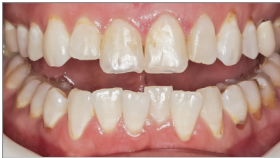
Pre-Op Retracted View-Open